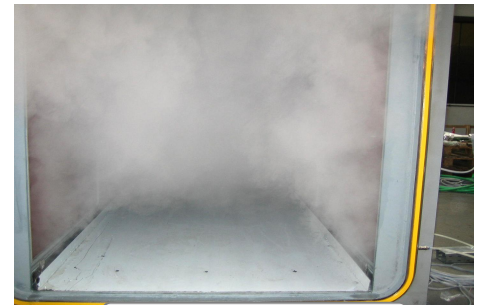
PREVAP 10 secs