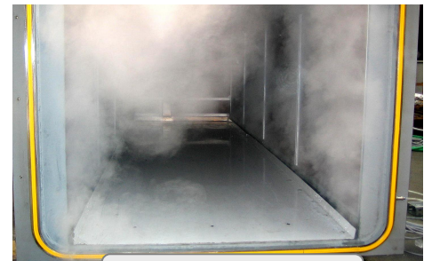
PREVAP 5 secs