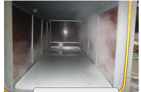
PREVAP 2 secs

Proven patent of WELKER. The bobbins cool out inside the machine after the saturated steam process helping to keep the moisture inside and reducing evaporation during the cooling time.